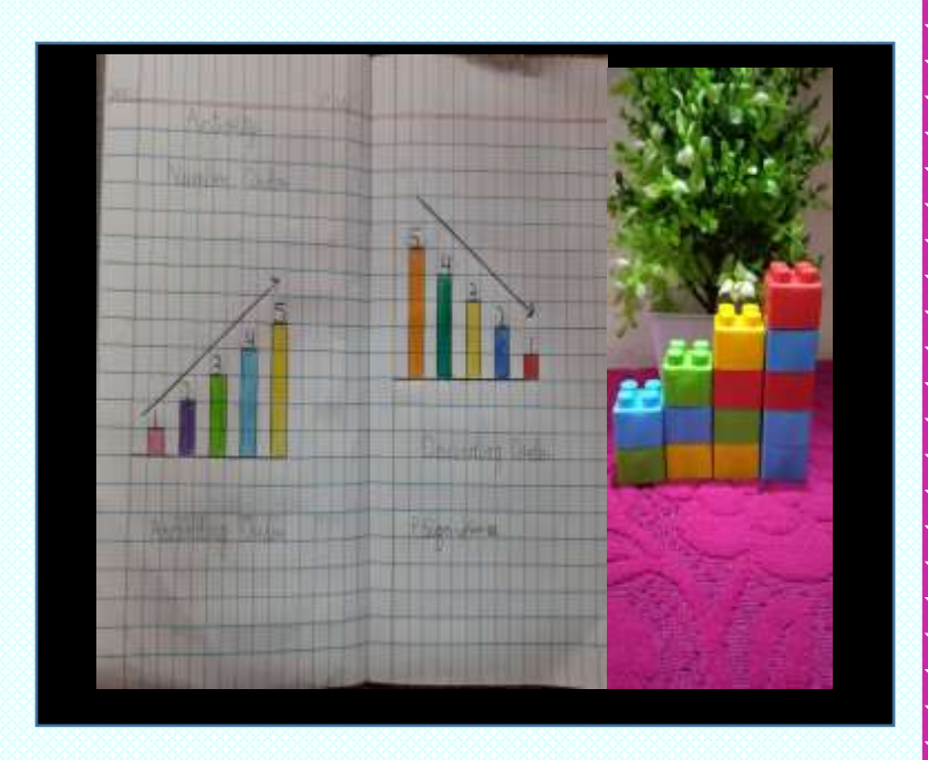
Class - II

Students understood the concept of ascending and descending order by drawing bars from smallest to greatest and greatest to smallest numbers respectively. It helped them to grasp the concepts in a pictorial way.